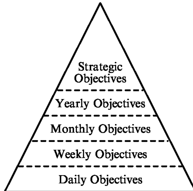
Figure (1): Pyramid of Objectives

Making a timetable for objectives is of great value when measuring efficiency and effectiveness of their achievement within the defined period. Activities within that period are to be arranged in accordance with priority of objectives or details so that objectives can be reached as scheduled.